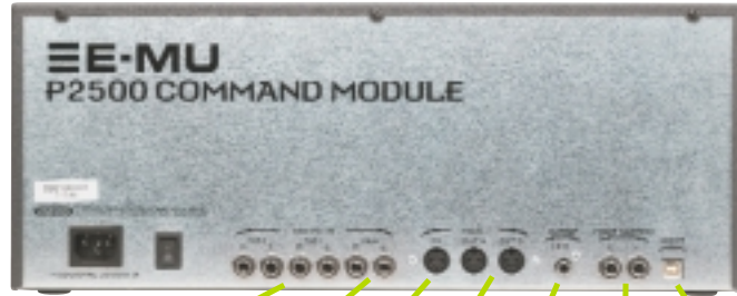
Sub Analog Outputs Main Analog Outputs MIDI In MIDI Out/Thru A & B S/PDIF Output Footswitch Inputs 1 & 2 USB Connector